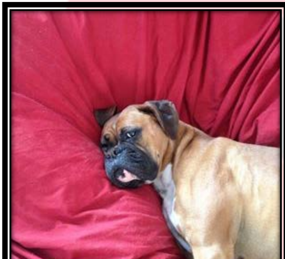
Sasha has the right idea... go back to bed... wake up in the spring!